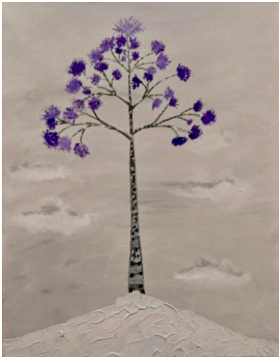
Acrylic on canvas by Guadalupe Taylor