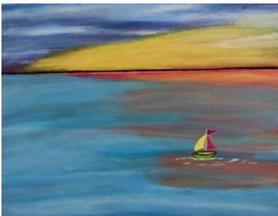
Acrylic on canvas by Guadalupe Taylor