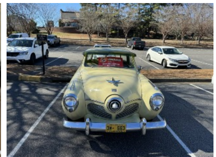
Two Studebakers present at the funeral were Ed's own Avanti and Alan Ziglin's '51 Starlight Coupe.