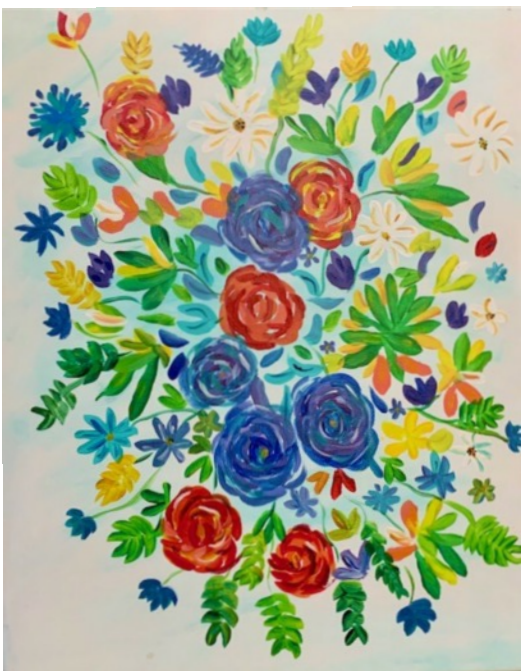
Acrylic on canvas by Guadalupe Taylor